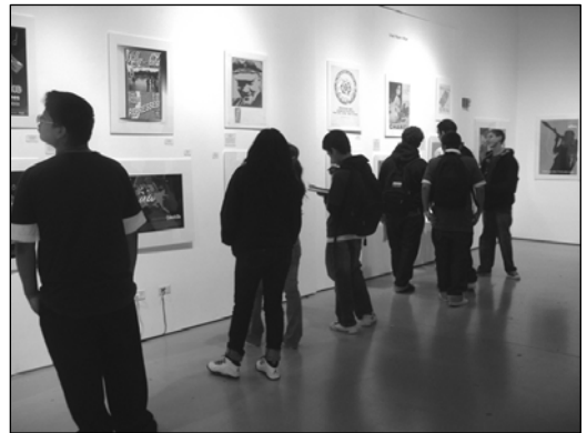
Left and Above: Students from Cleveland High School and Northridge Academy select posters from Subvertisements to analyze for an English assignment.

memory of struggles past and an inspirational resource for new efforts to create a more just world.