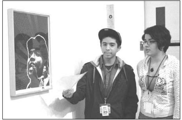
Students from MoCA's Apprenticeship Program discuss CSPG's Fred Hampton poster.