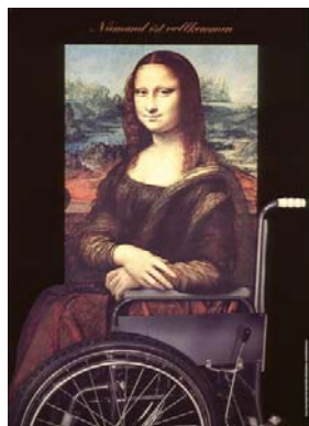
Klaus Staeck, Offset, 1981 Heidelberg, Germany