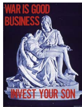
Lambert Studios, Inc., Offset 1969, United States

Center for the Study of Political Graphics • 8124 West Third Street, Suite 211 Los Angeles, CA 90048-4039 • telephone 323.653.4662 | fax 323.653.6991 email cspg@politicalgraphics.org • website www.politicalgraphics.org